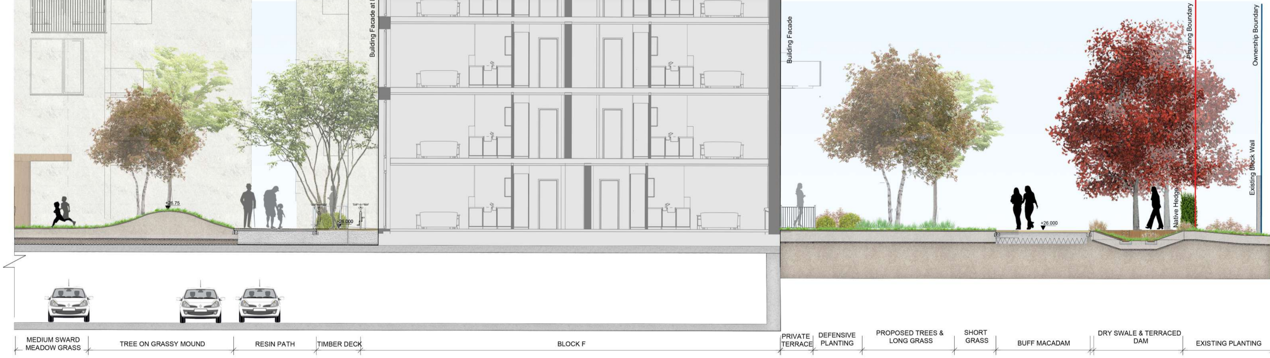
2 Section 2 - Part 2 of 2 scale 1:100 @A1

Disclaimer 1. This drawing is the property of Cameo & Partners Ltd. 2. It must not be copied or reproduced without written consent. 3. Do not scale from this drawing. 4. Check all dimensions on site before setting out.