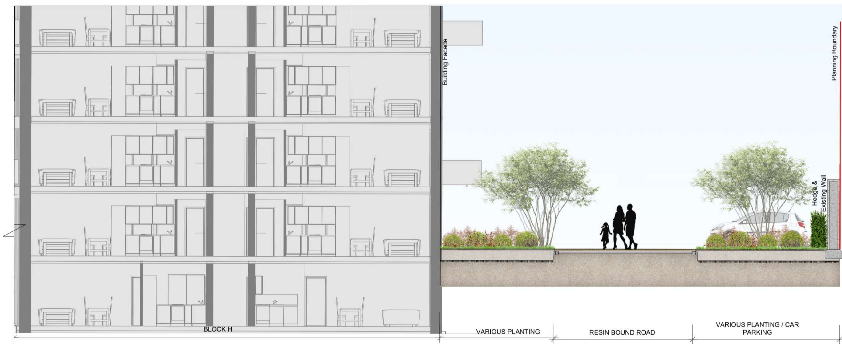
2 Section 3 - Part 2 of 2 502 scale 1:100 @A1

Disclaimer 1. This drawing is the property of Cameo & Partners Ltd. 2. It must not be copied or reproduced without written consent. 3. Do not scale from this drawing. 4. Check all dimensions on site before setting out.