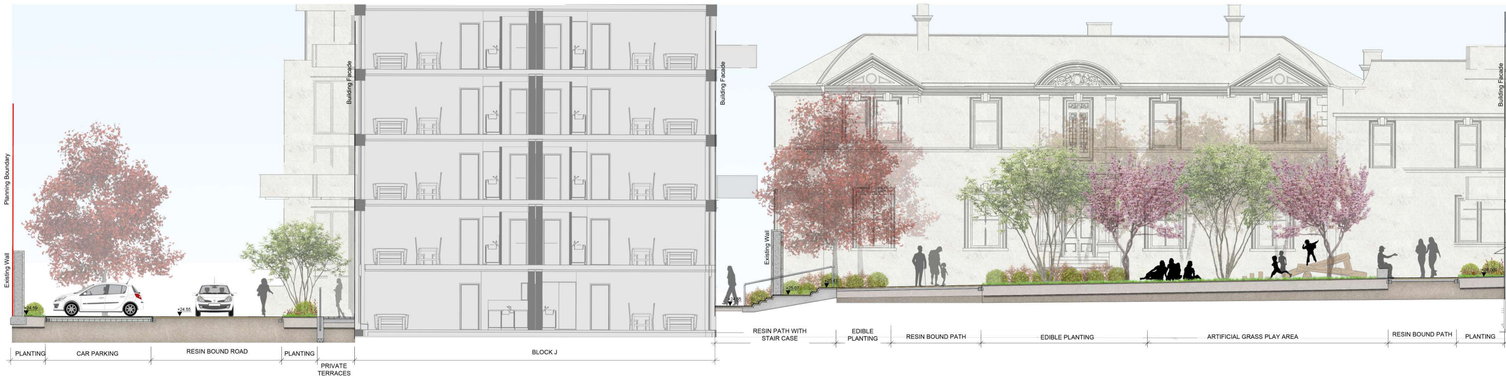
1 Section 3 - Part 1 of 2 502 scale 1:100 @A1