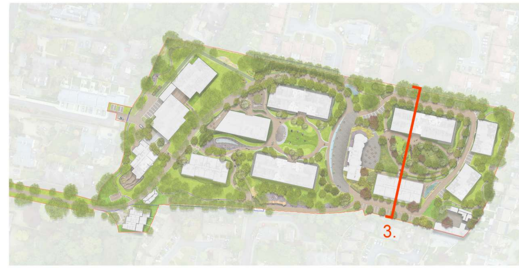
Key Location Plan

Disclaimer 1. This drawing is the property of Cameo & Partners Ltd. 2. It must not be copied or reproduced without written consent. 3. Do not scale from this drawing. 4. Check all dimensions on site before setting out.