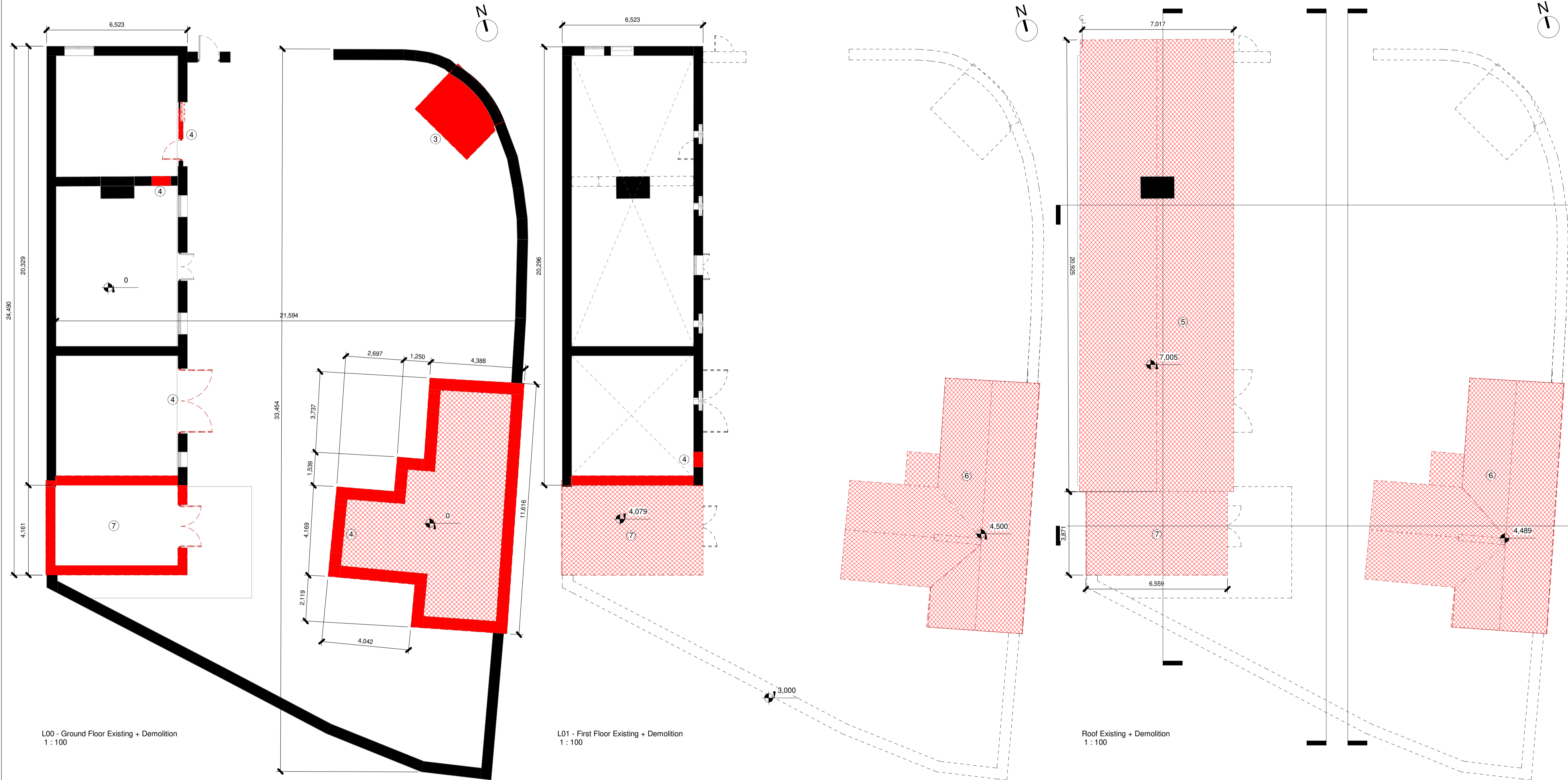
L00 - Ground Floor Existing + Demolition 1 : 100